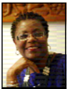
In Truth and Justice, Vernice