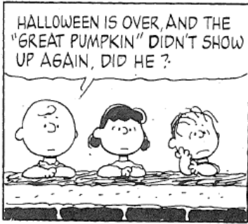
PEANUTS reprinted by permission of UFS, Inc. ©