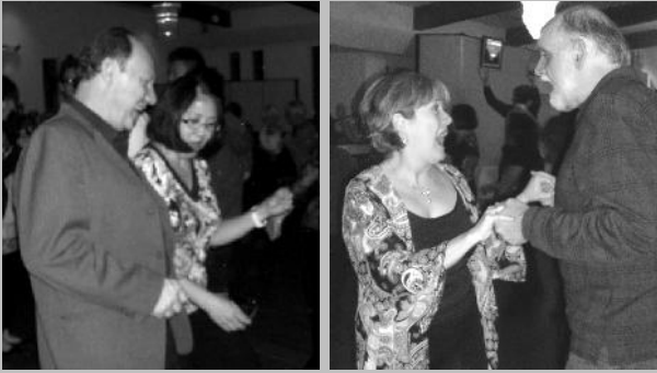
Photos From St. Steven Fund Raiser Dinner Dance.