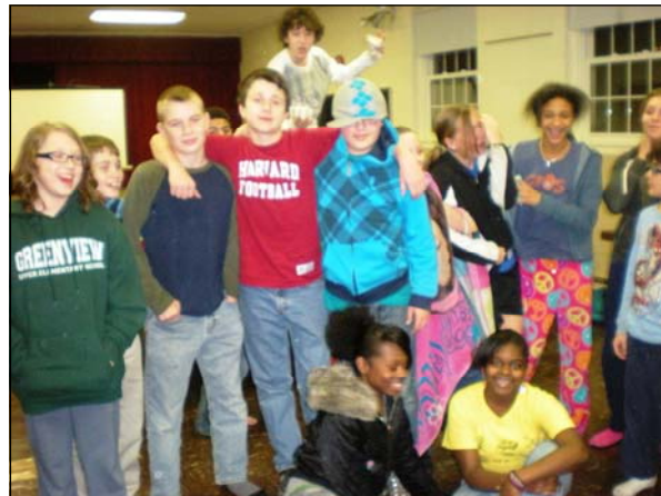
Chi Rho lock-in!