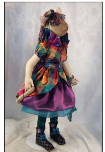
Thon Burlingame's prizewinning doll!