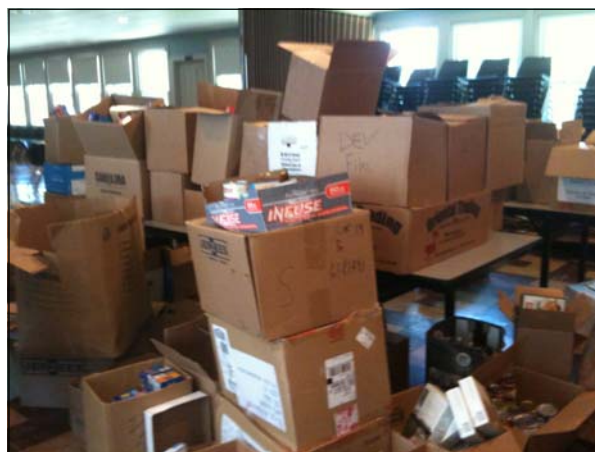
HEFC donations from Notre Dame College! See page 6