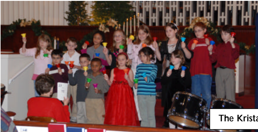
The Kristal Bells

Thanks for coming today – come again soon!