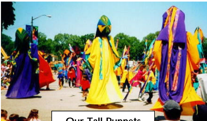
Our Tall Puppets