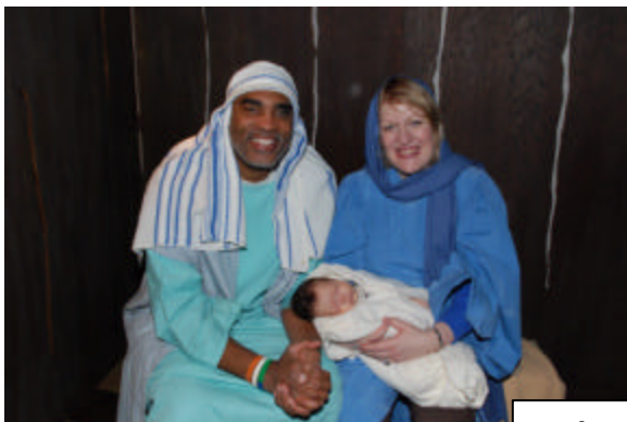
Journey to Bethlehem