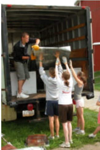
2007 Youth Mission Trip