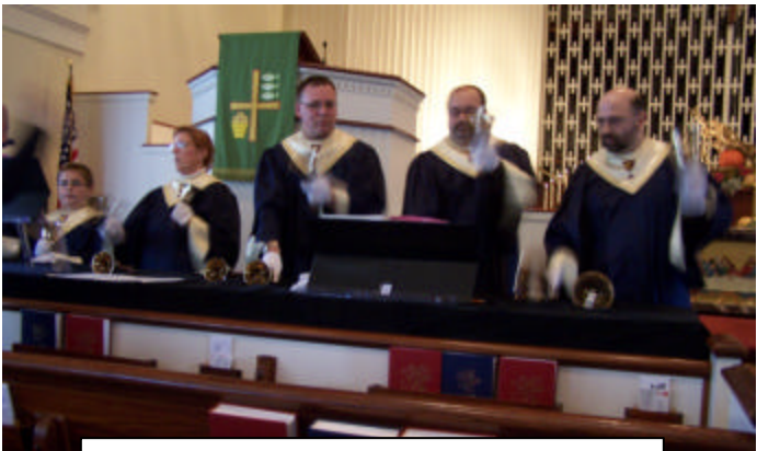
Joyful Bells and Chancel Choir