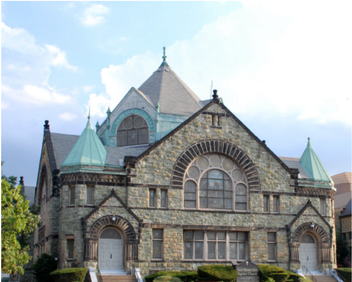
Our Past – The Greenstone