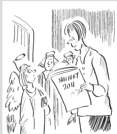
"Nice idea, Amelia, but I don't think the Angel of the Lord texting the shepherds would have the same dramatic effect."

See page 10 for a list of all forthcoming events