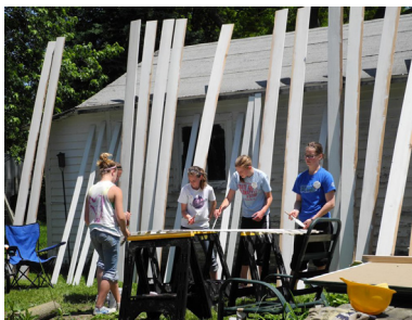
Paint Girls cover siding board to replace some on second floor of house on driveway side of the home.