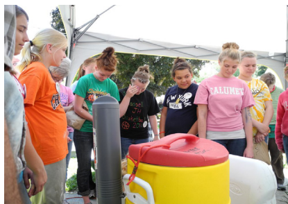
Team pauses for prayer of thanks before eating lunch during one of the work days at the James St. Project.