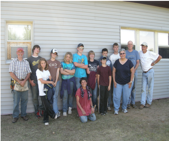
2010 Team To GCCP

Team finishes up week by standing in front of one of the projects they worked on during their week in mission on the Eastern end of the U.P.