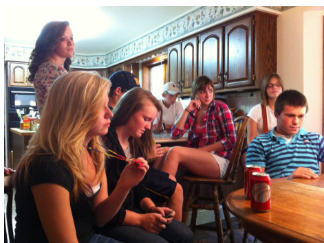
Grace Youth Group kick off meeting and Pizza Party

This meeting is open to all at Grace church. We will celebrate the past year's ministry. We will approve recommendations for who will serve on each ministry committee. We will also report on financial items for next year. Mark your calendars now so that you can come celebrate and help plan for Grace church's ministry.