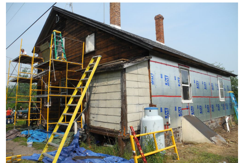
Team from Covenant Lutheran works to cover Baltic Project in R-board during their mission week in Keweenaw.