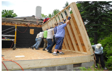
First wall of the Copper City Project goes up. Bath - Gunnisonville Team hard at work. Great team and great friends. Returning to work next year!