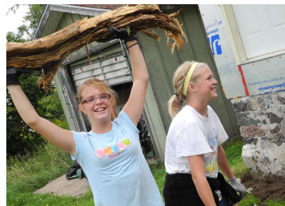
Victory! Two members of the Gladstone team dig out stumps and roots at the Baltic Project.