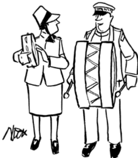
"Know what would be fun, sister? A music video."

I shall run in the paths of your commands for you have set my heart free.